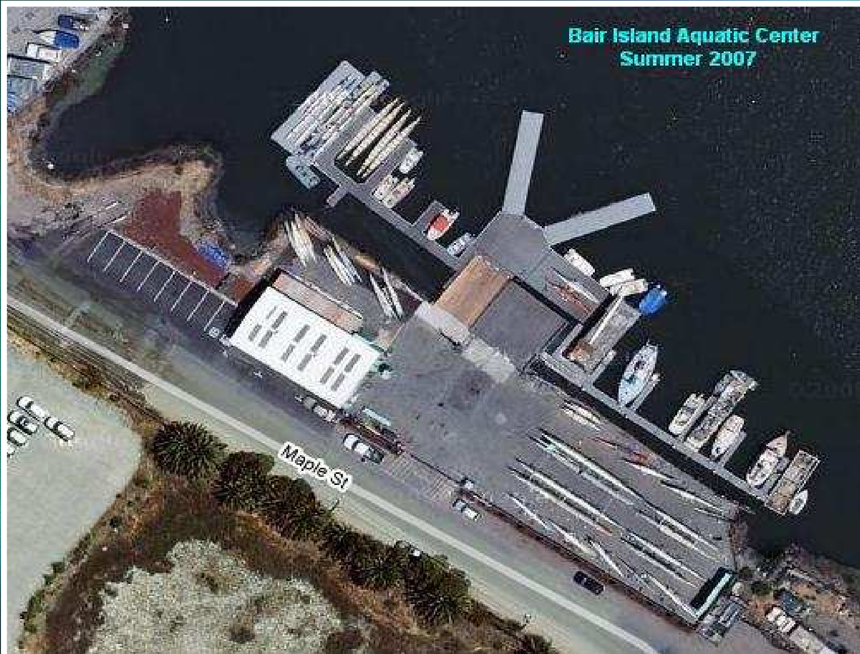
Bair Island Aquatic Center Summer 2007